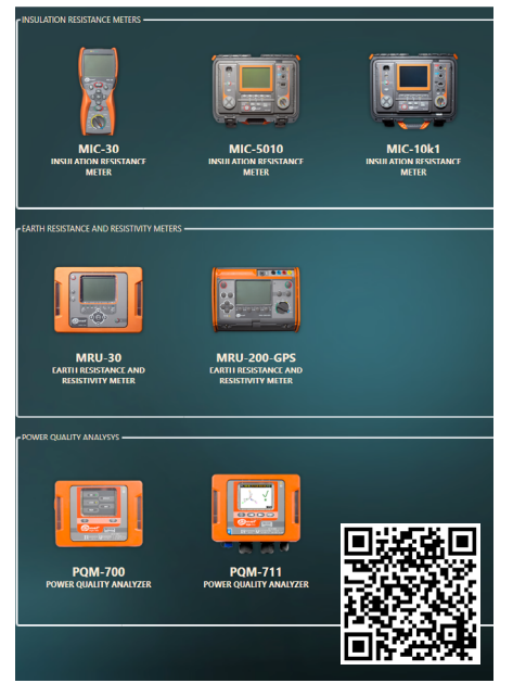
Get to know the instrument before buying