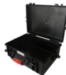
Cable plastic case