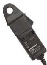
Current clamp 30/300 A