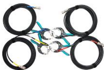
H winding test cable set

All specifications herein are valid at ambient temperature of + 25 °C and recommended accessories. Specifications are subject to change without notice Specifications are valid if the instrument is used with the recommended set of accessories