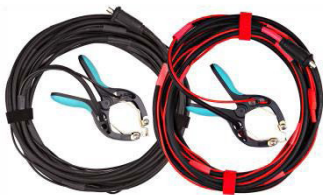
Current and Sense cables with TTA clamps