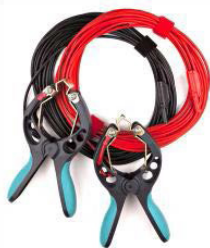
Voltage Sense cables with TTA clamps