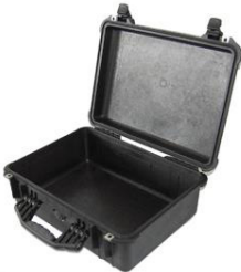
Cable plastic case