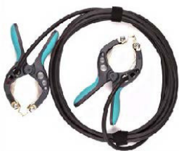
Current connection cable with TTA clamps