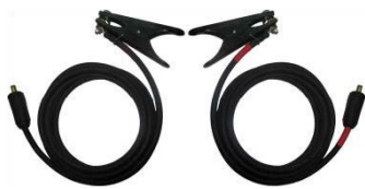
Current cables with battery clamps

All specifications herein are valid at ambient temperature of + 25 °C and recommended accessories. Specifications are subject to change without notice. Specifications are valid if the instrument is used with the recommended set of accessories.