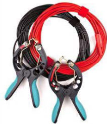
Voltage Sense cables with TTA clamps