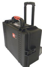
Cable plastic case with wheels