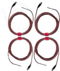
Temperature probes 4 x 50 mm (1.97 in) + 5 m (16.4 ft) cable set