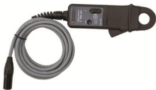
Current clamp 30/300 A with extension 5 m (16.4 ft)