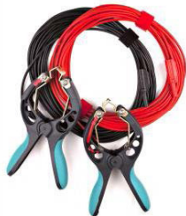
Voltage Sense cables with TTA clamps