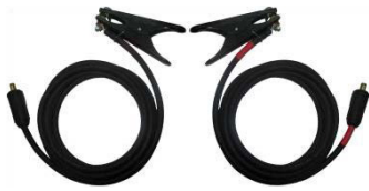
Current cables with battery clamps