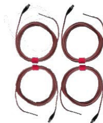
Temperature probes 4 x 50 mm (1.97 in) + 5 m (16.4 ft) cable set