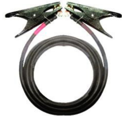
Current connection cable