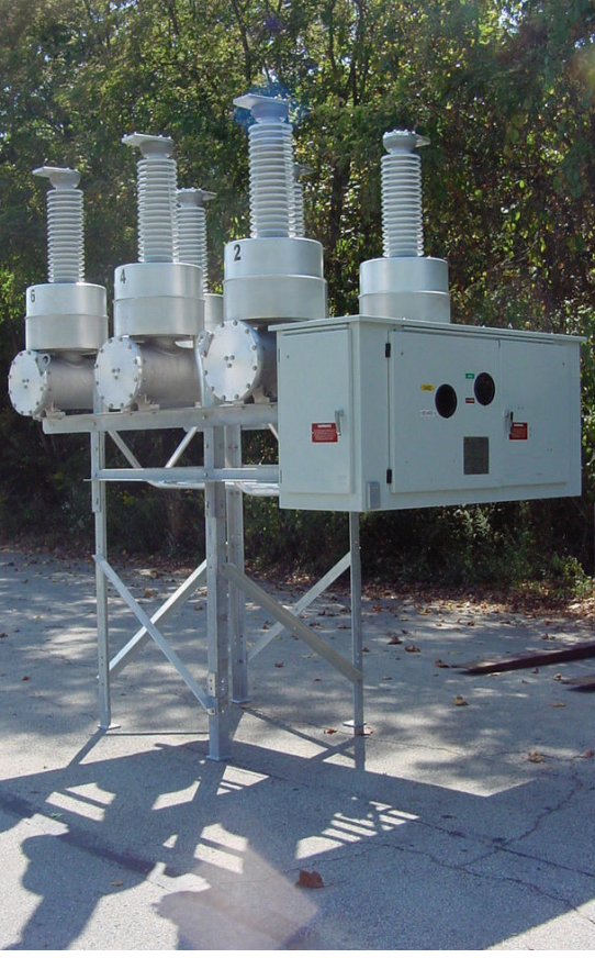
CIRCUIT BREAKER - 72,5kV: Weight of SF6: 29 lbs - 13 Kg